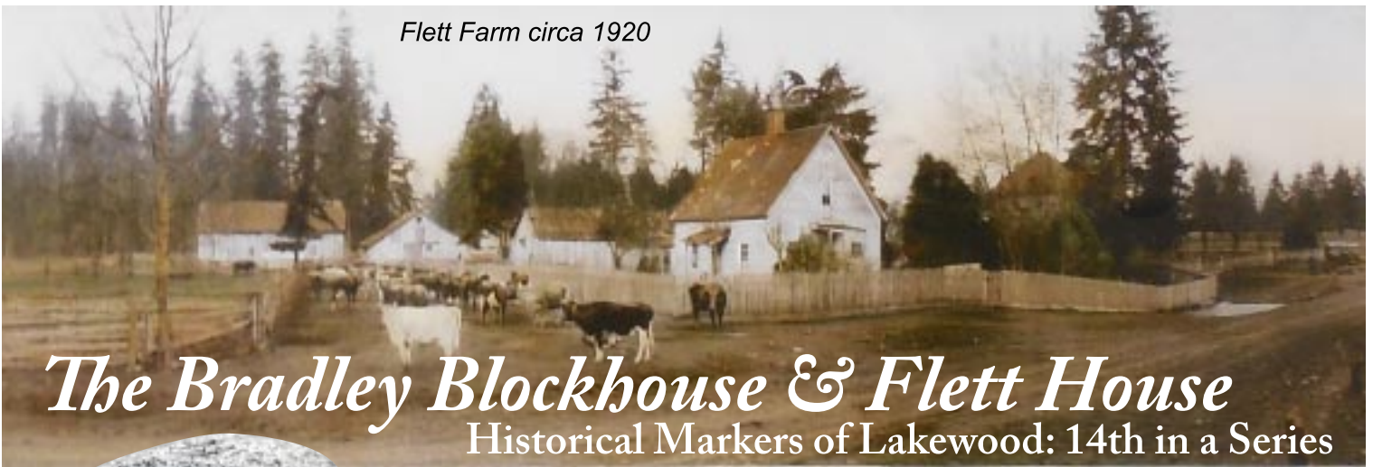
Flett Farm circa 1920