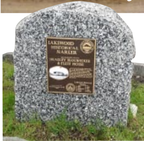
Marker at the northwest corner of Bridgeport Way and Custer Road.

Emigrating from the Orkney Islands to present day Lakewood in the 1840's, the Flett family settled by a creek—one that bears their name to this day.