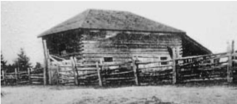
From barn to blockhouse to barn again.

For the next 91 years, Flett Dairy supplied milk, buttermilk, cottage cheese and ice cream to stores throughout western Washington. Growth in both population and development finally made so vast a bucolic enterprise untenable and the dairy closed its doors in 1994.