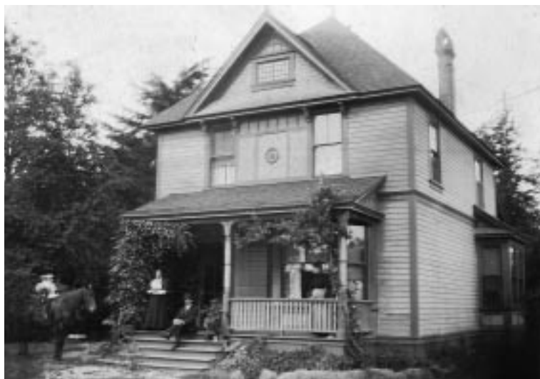
The Flett House in the early 1900's.