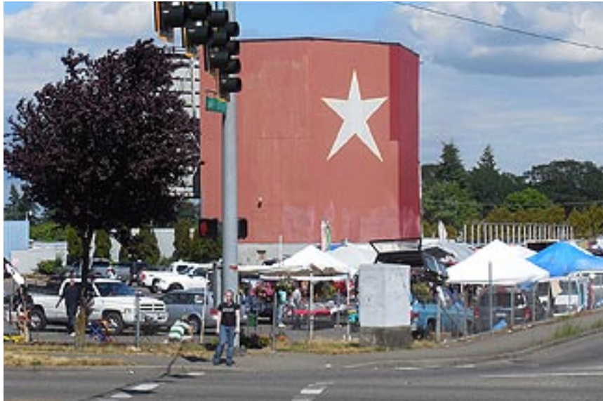
"Star-Lite, star brite..."