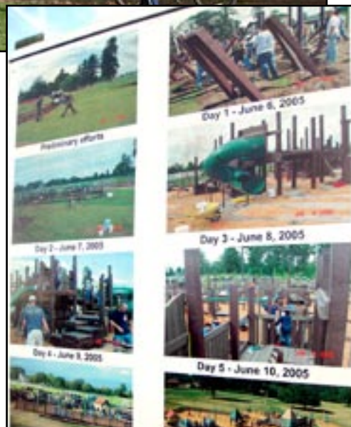
Posted nearby: a sign displaying photos from the playground's various stages of construction

Be sure to stop by the Lakewood History Museum and see the park's display in our recently installed exhibit, "Playgrounds of the Lakes District".