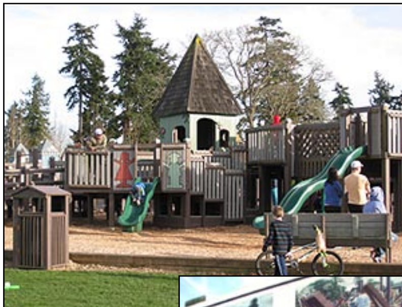
Just one corner of the completed playground.

Had it been built using the city budget, the playground would have cost $600,000; instead $200,000 was spent on the project, and it holds a place of pride for those who made it a reality.